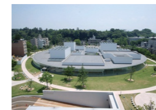
21 st Century Museum